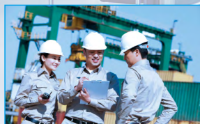
Port & Airport