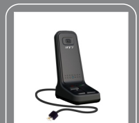
Desktop Microphone SM10R2