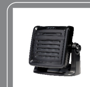
External speaker SM09S2