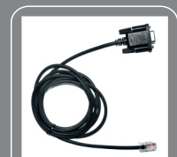
Programming cable PC21