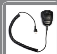
Palm microphone SM07R2