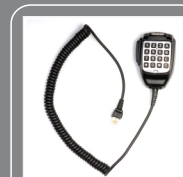
Keypad microphone SM07R1