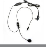
Light-weight, Behind-the-Head Earpiece with in-Line PTT & VOX ECM11