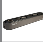
MCU rapid-rate multi-unit charger for Li-Ion/Ni-MH batteries MCA02