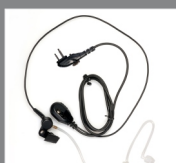
Earpiece with on-MIC PTT & VOX & Transparent Acoustic Tube EAM12