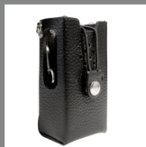
Leather carrying case LCBN56