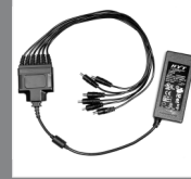
Six-unit switching power (Japan) PS7001