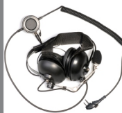
Behind-the-head, noise-cancelling & VOX headset ECM14