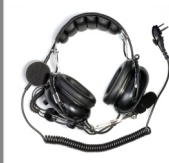
Heavy weight high-quality noise-cancelling & VOX headset ECM13