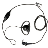
D-earset with in-Line PTT & microphone & VOX EHM15